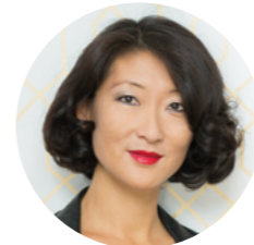
Fleur Pellerin Former minister, founder and CEO of Korelya Capital.